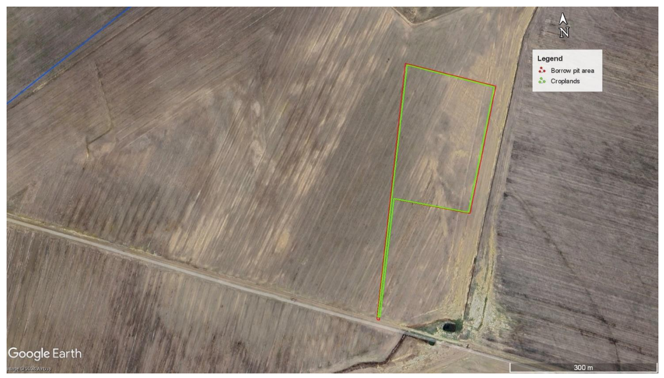
Figure 3. Satellite image map of the borrow pit area.