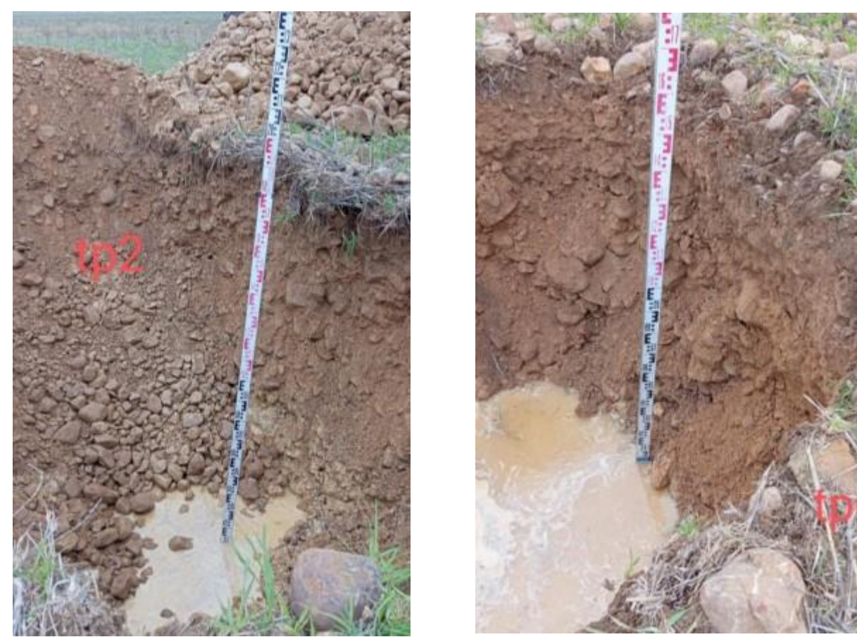
Figure 4. Typical soil profiles in test pits on the site.