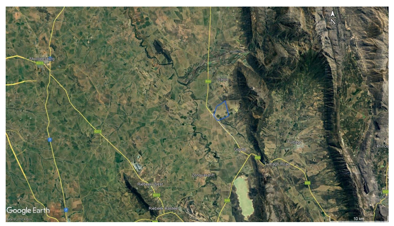
Figure 1. Locality map of the property boundary on which the Borrow pit is located northwest of Gouda.

Environmental and change of land use authorisation is being sought for a borrow pit on farm number 2/83 near Gouda, Western Cape (see location in Figure 1). In terms of the National Environmental Management Act (Act No 107 of 1998 - NEMA), an application for environmental authorisation requires an agricultural assessment. In this case, based on the high agricultural sensitivity of the footprint (see Section 7), the level of agricultural assessment required by the protocol is an Agricultural Agro-Ecosystem Specialist Assessment.